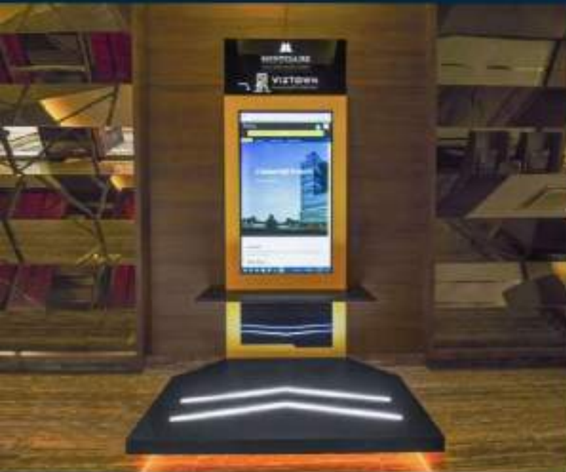
MONT CLAIRE - PUNE