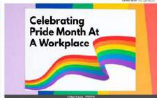
Celebrating Pride Month At a Workplace

Subscribe to our newsletter Why this is all-CO