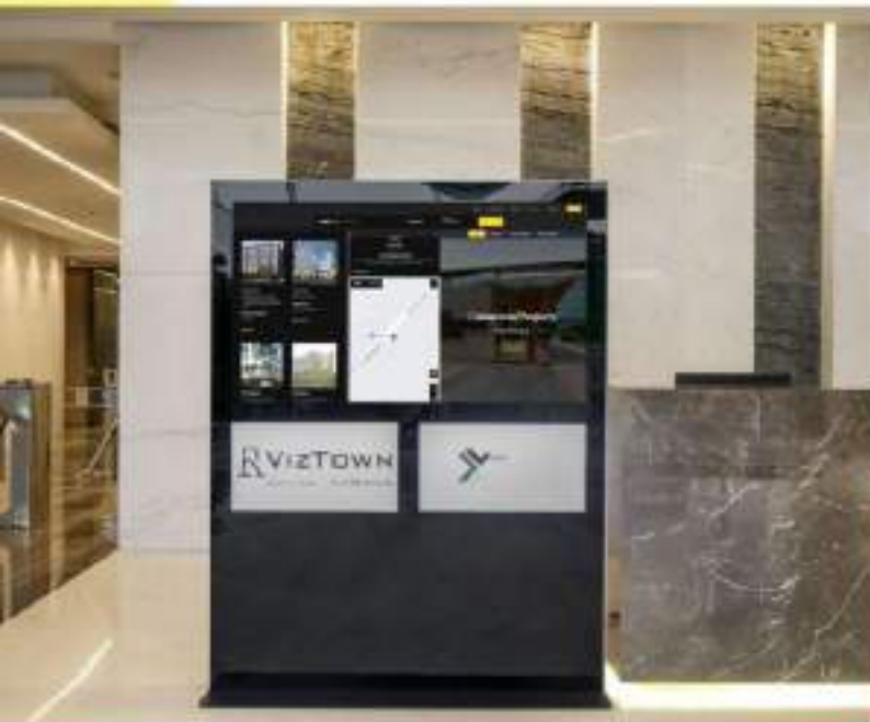
GMR - HYDERABAD