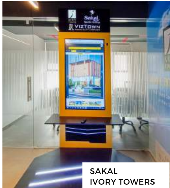
SAKAL IVORY TOWERS