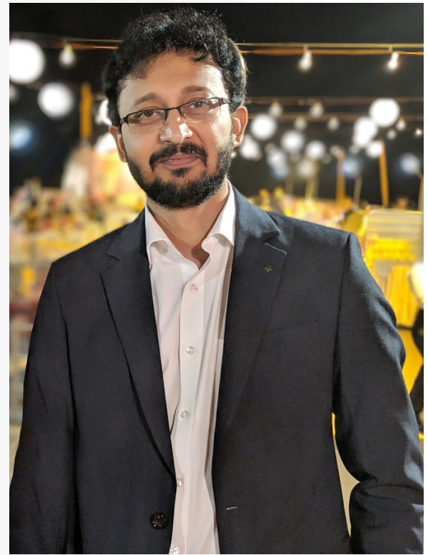
Partner, Head of Product

As a growing brand, we are excited to share our success stories with our partners who are the catalyst of our growth. It has been a long and enriching journey with each milestone testifying our commitment and drive to excel. Following the launch of VIZSTORE , we are all set to launch the web version of the application this month.